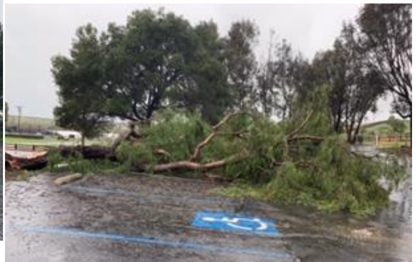
Our Pepper tree didn't survive the wind and rain.