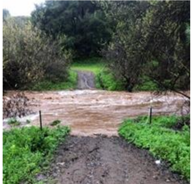
Later the 14th