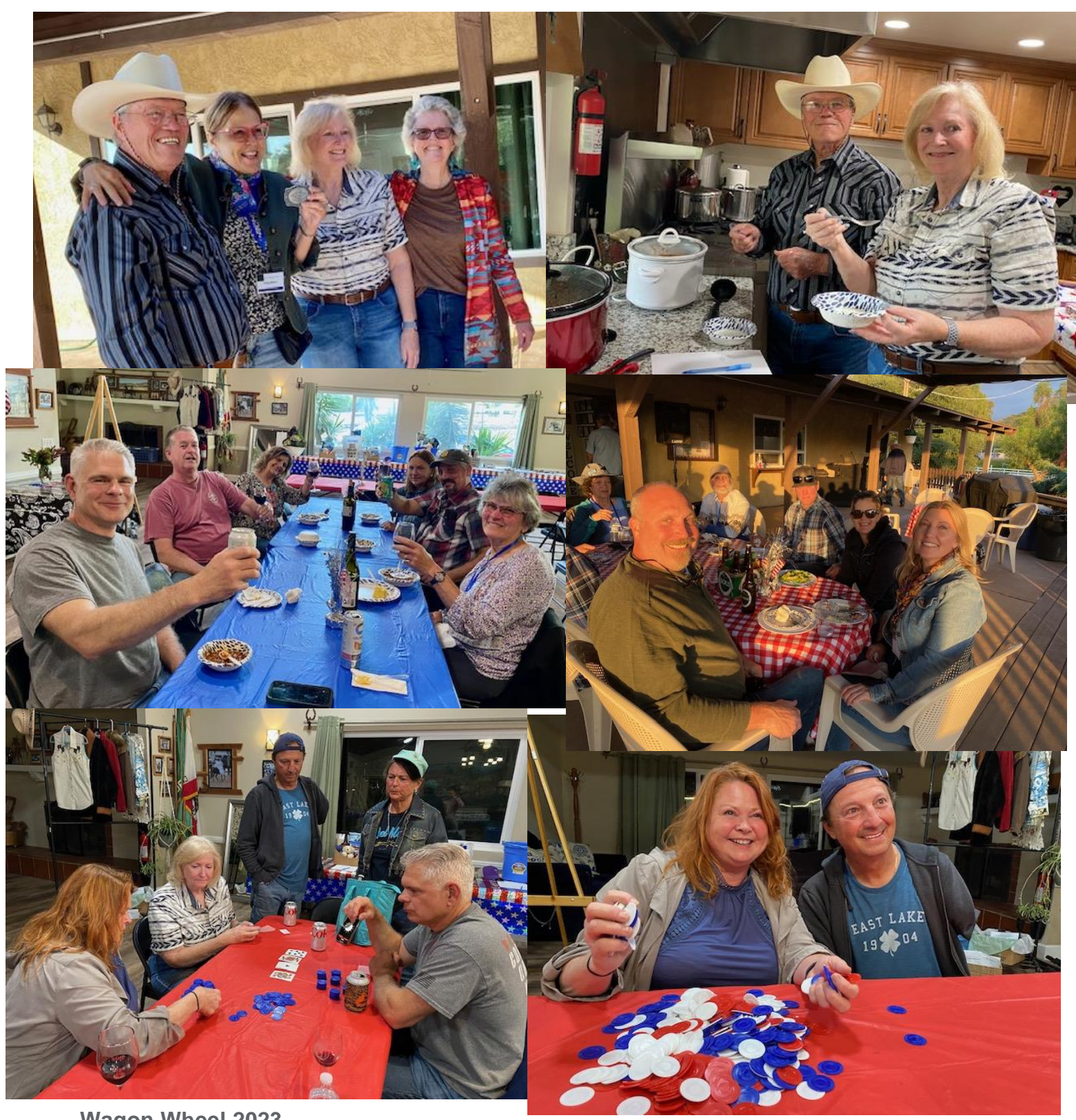
Wagon Wheel 2023